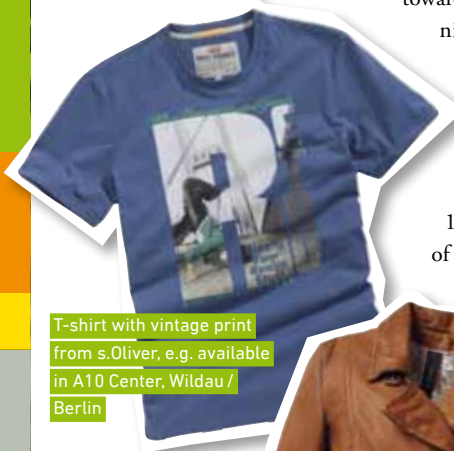
T-shirt with vintage print from s.Oliver, e.g. available in A10 Center, Wildau / Berlin

Our shopping center portfolio began taking small steps along the path toward growth in 2012: At the beginning of the year we increased our shareholdings in the shopping centers in Dessau (Rathaus-Center), Hamm (Allee-Center) and Viernheim (Rhein-Neckar-Zentrum) to 100%. This entailed investments of around €15 million.