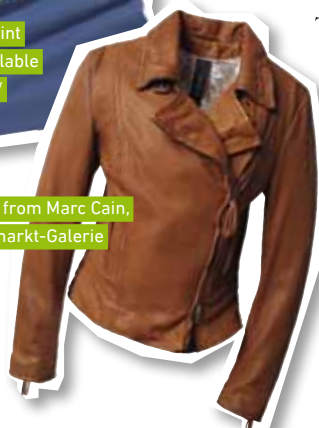
Leather jacket from Marc Cain, as seen in Altmarkt-Galerie Dresden

The supply side of the shopping center transaction market remains brisk and opportunities could continue to arise; we will examine those opportunities diligently and, if appropriate, utilise them flexibly.